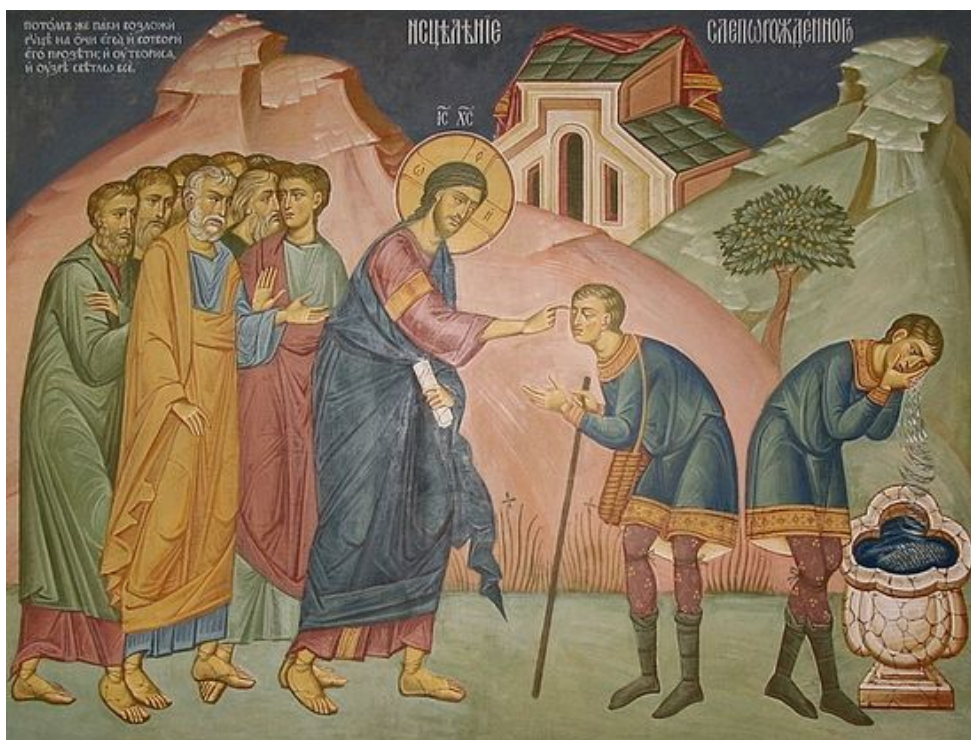
Icon of the Man Born Blind