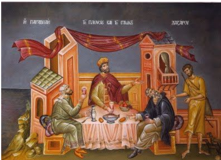
The Rich Man and Lazarus

I believe that if we follow the above guidelines, this can indeed be a very fruitful experience for our parish and will add some variety to our liturgical life at OLPH. The first official use of this program will be October 31, 2021.