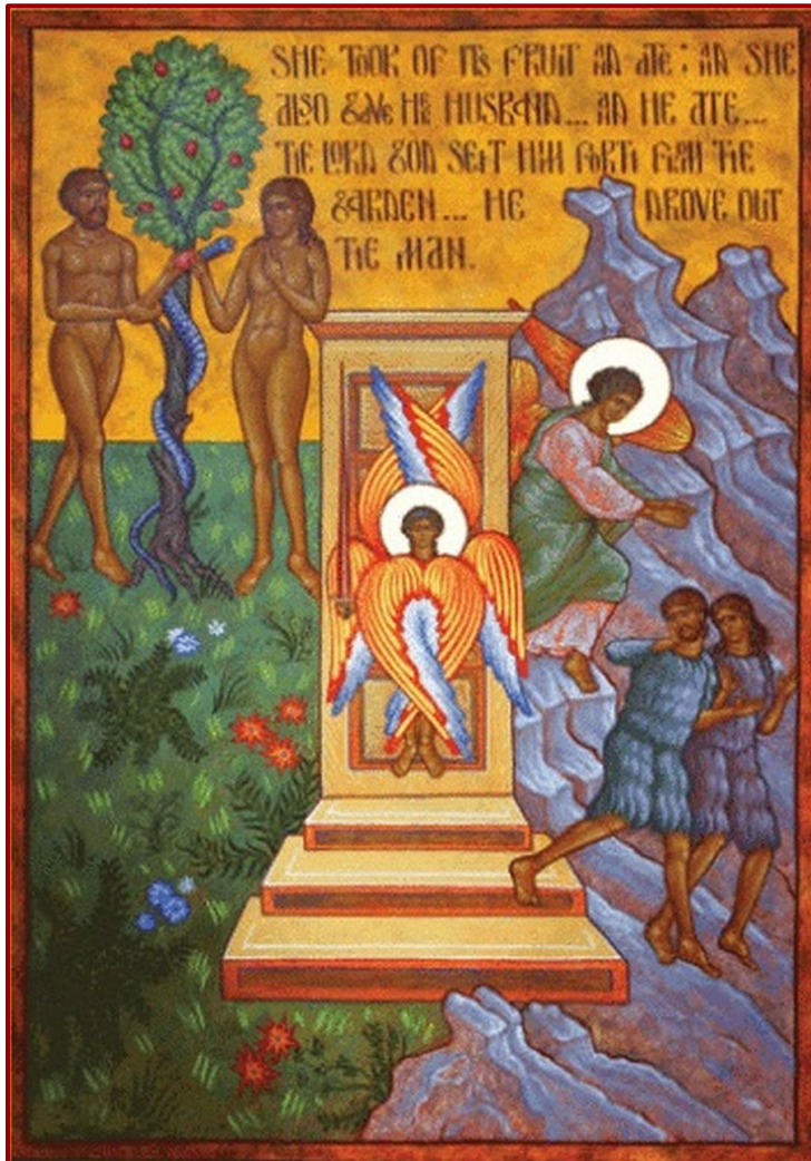
The Expulsion of Adam and Eve from the Garden